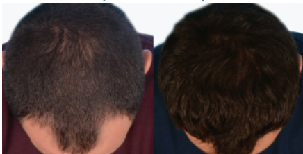
BEFORE 16 WEEKS