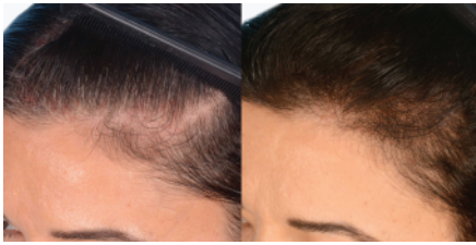
BEFORE 16 WEEKS

"I have been using the Anteage hair growth products for 5 months. The products are easy to use and come with a simple applicator that insures all the hair solution ends up on your head and not the floor. My hair has become thicker and I can see new hair growth on the sides of my temples which I have not had before. The products in combination with the office visits have made a big difference in my hair quality and thickness." - Natthalie K