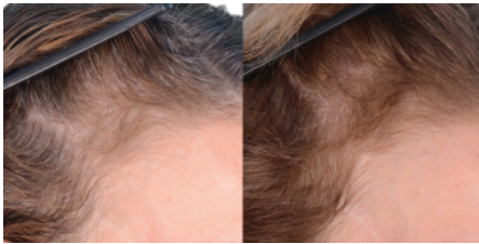
BEFORE 16 WEEKS